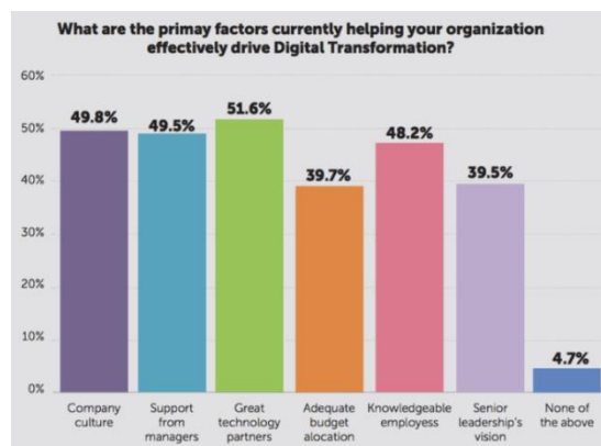
Fig. no. 2: Internal factors of Digital Transformation

The latest wave of digital transformation has brought a new set of characteristics posing challenges to firms worldwide. In order to assess the status of autonomous team structures, it is therefore crucial to determine those key drivers of the digital era. By detecting those driving forces on corporation level, organizations are enabled to critically define the viability of self-managed teams for their individual firm. Focusing on this matter is at the core of Futurum Research’s (2018) analysis on digitalization effects. Figure 2 highlights the results of the annual study allowing firms to understand the value of key company values for weathering the challenges posed by digital transformation. It centers on a set of main parameters for successful digital evolution. While creating technology partnerships scores the highest approval rating in light of the importance of overall technological development, the following three elements company culture, manager support and employee skills are important factors for establishing autonomous team structures.