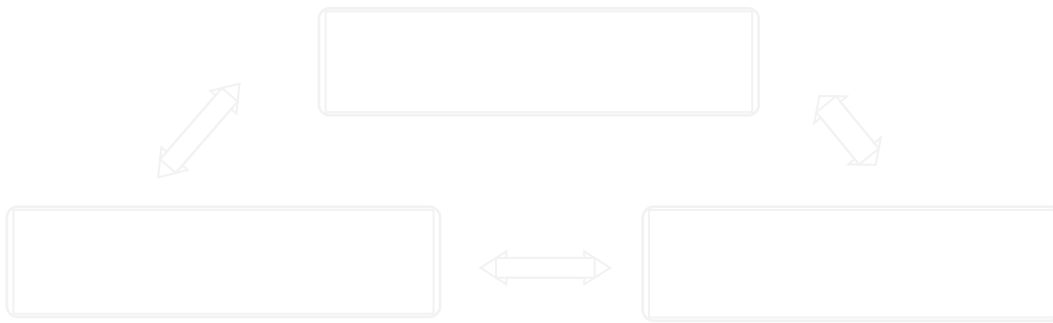
Fig. no. 3: Triangle of Objectives

All three groups were allowed to select their team coach from a list of volunteering team heads with the new role deviating from the standard setting in the sense, that the team coach was supposed to work as a mediator facilitator and door opener. In this case, there was a distinct difference to the previous supervisory role. A short introduction by the scrum team was provided to the three groups concerning the objectives (Figure 3) and expectations prior to sending them on their two month journey towards self-management: