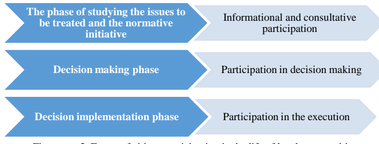
Figure no. 3. Forms of citizen participation in the life of local communities

The following forms of citizen participation can be distinguished, depending on certain phases of the decision-making process (see Figure no. 3):