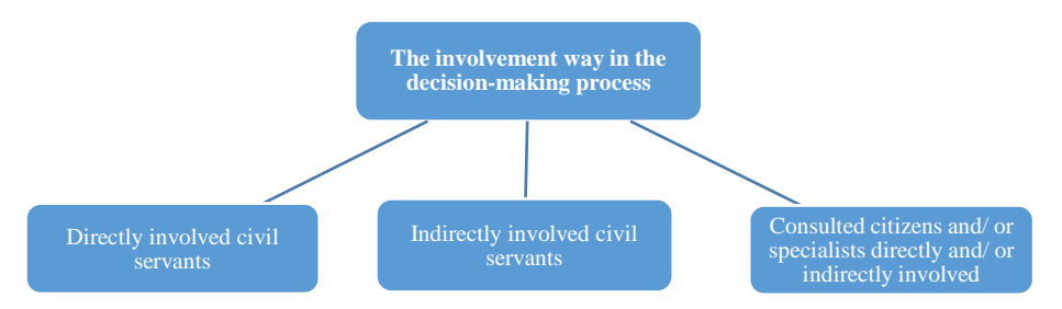
Figure no. 1. Categories of participants according to the way of involvement in the decision-making process

A. A special criterion for delimiting the participants is the way in which they are involved in the decisionmaking process (see Figure no. 1):