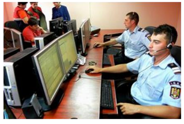
Fig.3. Dispatch I.G.S.U.

Transmission System a metal gearbox Motor 37DX52L mm and encoder feedback control of movement;