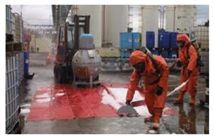
Fig.1. Intervention at an objective risk of major accidents involving dangerous substances

At the moment there is IGSU equipment such robotic platform with interchangeable modules, especially for data collection and information to