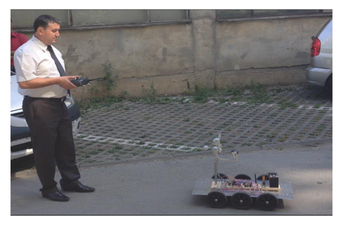
Figure 4. Testing of the experimental model.

The research is focused on the behavior and the experimental model in different situations platform. The