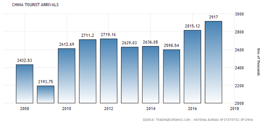
Figure 4. China Inbound Tourist Arrivals

When Beijing’s inbound tourists’ growth rate decreased in the year 2017, China’s total foreign arrival growth rate was increasing. For the whole year of 2017, the number of inbound tourists reached 139.48 million, an increase of 0.8% over the same period of the previous year. Among them: foreigners 29.71 million, an increase of 3.6%; Hong Kong tourists reached 79.8 million, a decrease of 1.6%; Macao visitors reached 24.65 million, an increase of 4.9%; Taiwan visitors reached 5.87 million, an increase of 2.5%.