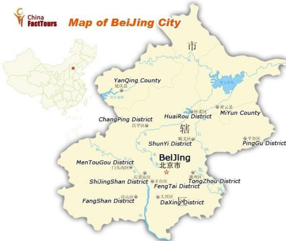
Figure 1. Map of Beijing

Beijing, the capital of China, siting in next to the Bohai Bay and the northern part of the Northern China Plain, covers a total area of 16,410km 2 , about 64% of which are mountains. Beijing has together 16 districts with a total population around 20,693,000 (The Year 2012), ranking the second largest city after Shanghai. It is one the four municipalities directly administrated by the center government of China. It is also one of the four ancient capitals in Chinese history.