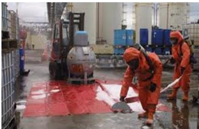
Fig.1. Intervention at an objective risk of major accidents involving dangerous substances

The modular concept of the experimental model is characterized by: